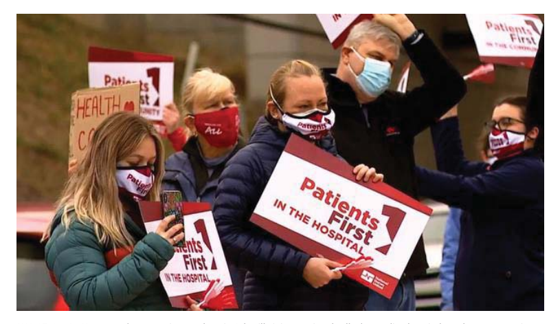
JAN. 27, 2021 - Nurses and community members in Asheville join a national rally demanding hospital employers put patients first above profit motives.

MISSION HOSPITAL NURSES UNION JOINS IN ON NATIONAL EVENT TO 'PUT PATIENTS FIRST'