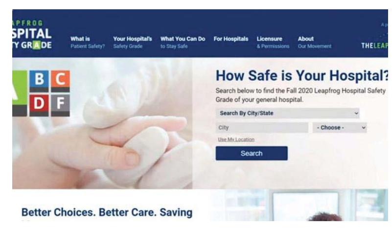
Leapfrog's Hospital Safety Survey in the fall gave Mission an "A" with high scores in preventing errors, qualified nurses, and effective leadership.

along with partnering with our local Chamber and Workforce Development Board."