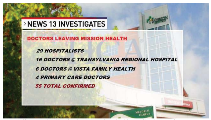
Mission Health won't provide workforce data about how many doctors have left or been hired since HCA took over. News 13 has confirmed that dozens of doctors are choosing to leave.

When you include the primary care doctors we've learned about, it totals 55. Those are just the doctors we've confirmed.