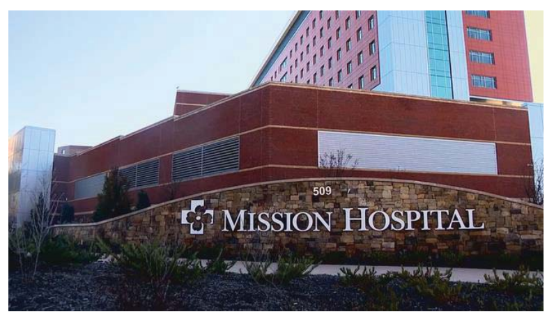
FILE - Mission Hospital in Asheville, North Carolina.

Mission Response: "In the letter you are referencing, the data mentions that Mission's charges for the four years prior to its sale AVERAGED 6.8 percent. Just as those earlier charge increases fluctuated given market drivers, so likely will ours. Please stay tuned for the Community Impact Report, which will be released later this year and may answer some of your additional questions."